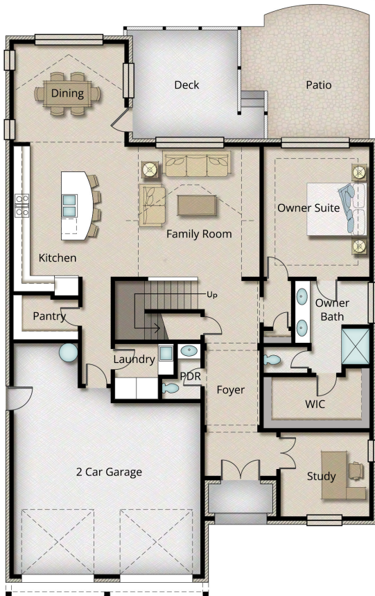
Base Main Floor Plan