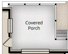
Optional Covered Porch