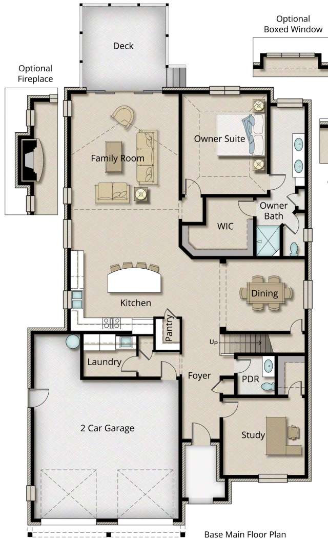
Base Main Floor Plan